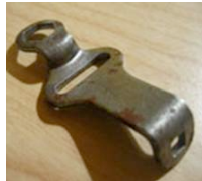
I am sure we all remember these.