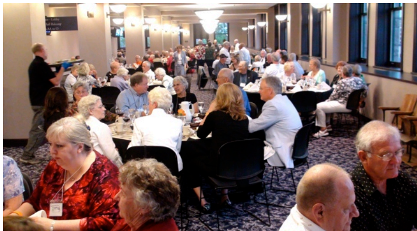
Just a portion of the large crowd enjoying the delicious dinner in the "L" shaped dinning area on the 2nd floor of The Pavilion.