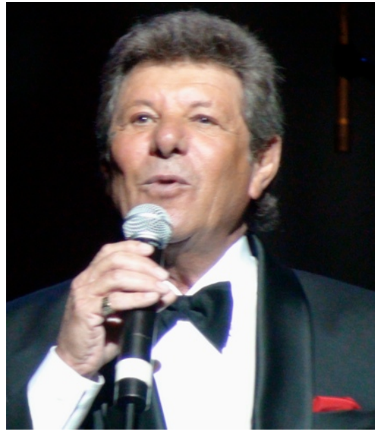
And He Was Great!